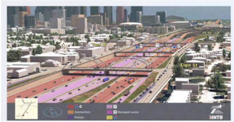
Digital rendering of the proposed NHHIP Segment 3 approaching Downtown from the I-69/US 59/SH 288 Interhange.

TxDOT's goal is to help households and individuals maintain their current social support networks. TxDOT recognizes that disruptions associated with moving can affect a resident's access to a strong social structure built over time. This can include community activities (church and school) and other regular routines such as grocery shopping, childcare, and medical services. Individual circumstances will vary, but minority, low-income and limited English proficiency populations may be especially vulnerable to such impacts. TxDOT will continue to work diligently to try to prevent such effects from occurring, and will implement a number of mitigation measures related to this issue including enhanced relocation services.