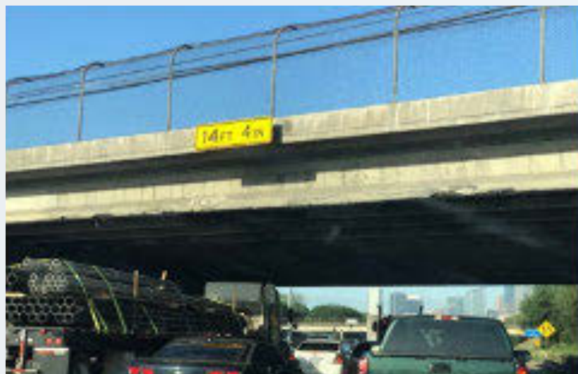
Bridges will be raised to meet national height standards.