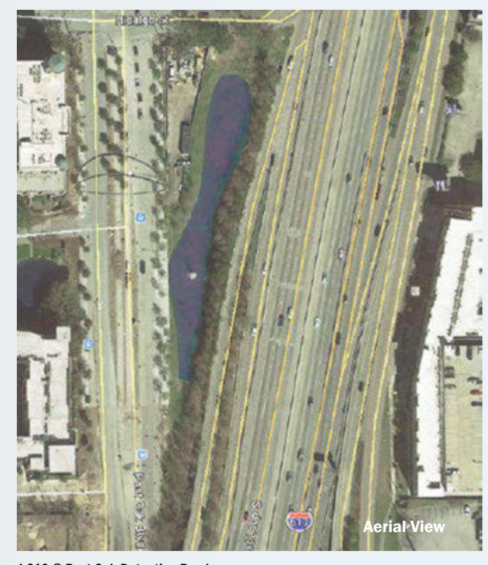
I-610 @ Post Oak Detention Pond.

The decision to depress or elevate a highway is based on several factors. The primary considerations include how to effectively improve mobility by reducing congestion, improve roadway safety, and enhance connectivity of the local street network while working within design criteria and constraints. For more information, please see the NHHIP paper on Lower the Highways .