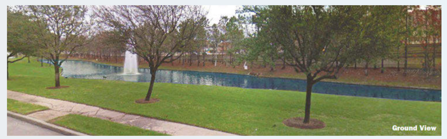
Landscape improvements and upgrades done through partnership with local management district.