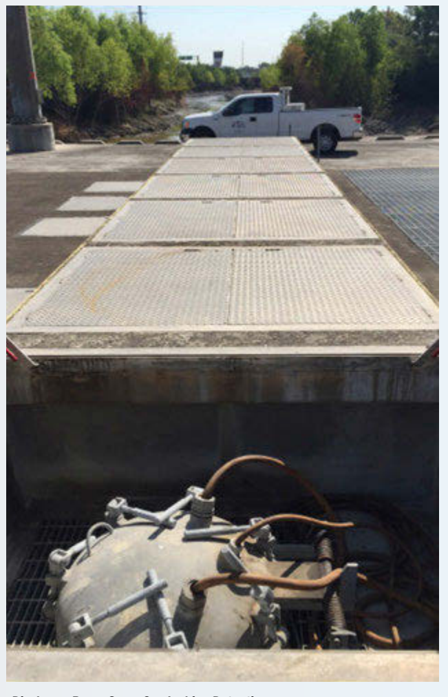
Discharge Pump Cover Overlooking Detention.

Safety is TxDOT's primary concern. The pump stations for the depressed sections of highway will be designed with backup pumps and backup generators to reduce the likelihood of a pump system failure. TxDOT is currently exploring the development of an alert system that will close access to depressed sections of the highways in the event of a pump failure.