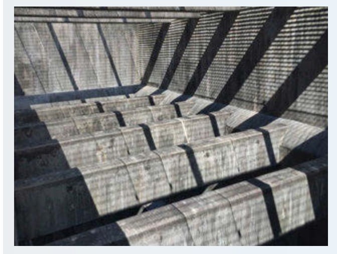
Upper Wet Well.