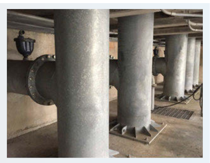
Pump Discharge Pipes.