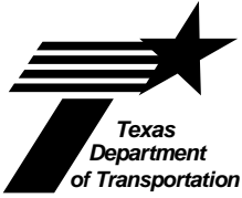
Exhibit A CDA SITE INVESTIGATION ON HIGHWAY RIGHT OF WAY IN THE FORT WORTH DISTRICT

_____ is giving written notice of proposed Work to take place within the right of way of _____ in Tarrant County, TX as follows: