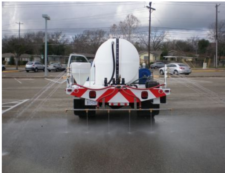
Figure 3-9. The herbicide rig is used to apply anti-icing liquids prior to an approaching storm. It is also used for de-icing applications during the storm.