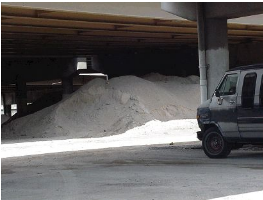
Figure 5-11. Salt storage under a bridge next to bridge columns.