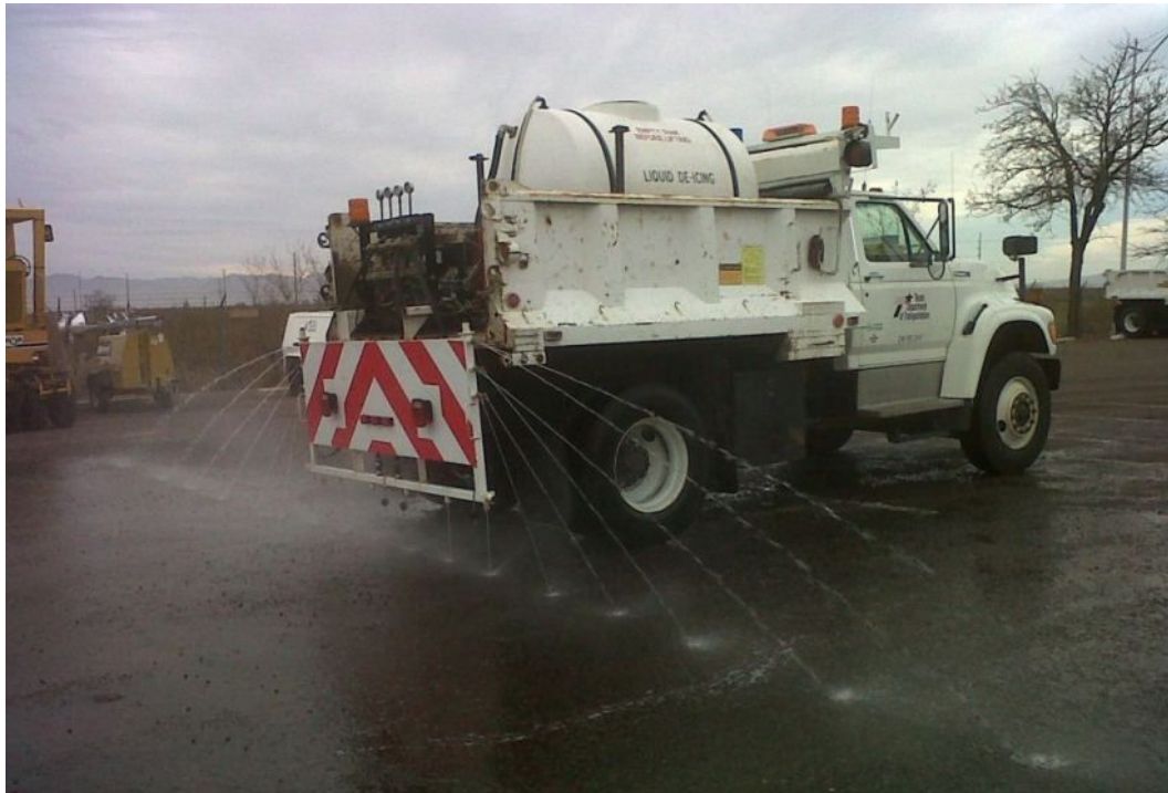
Figure 2-1. Application of liquid chemical by stream nozzles.