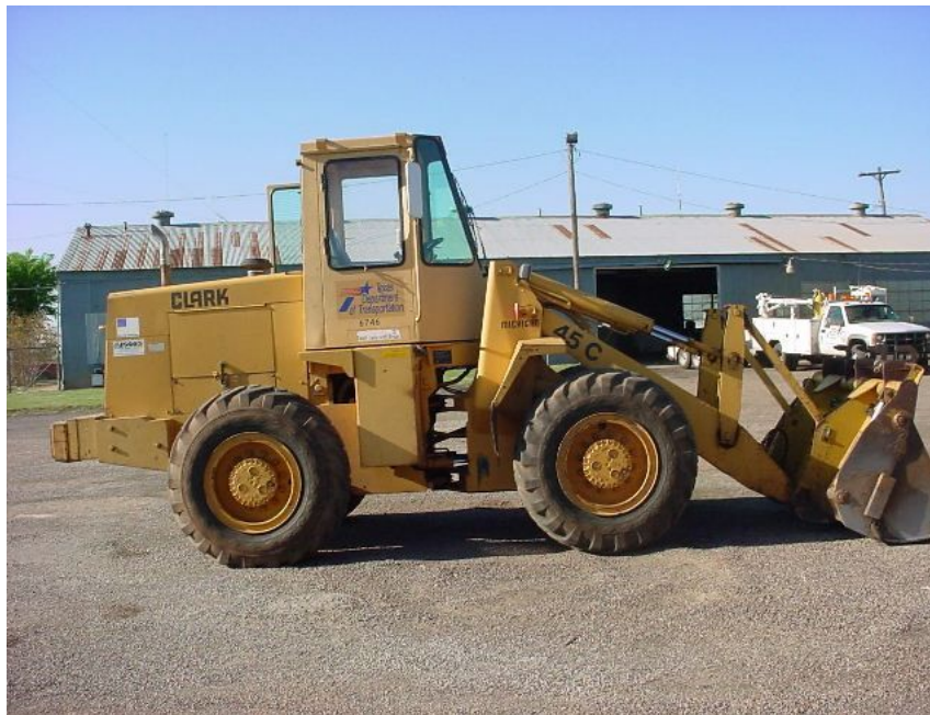
Figure 3-3. Loaders are a vital piece of equipment during a snow and/or ice event. They are used for loading material on the trucks to fight the ice and snow. They are also used to clear intersections and driveways.