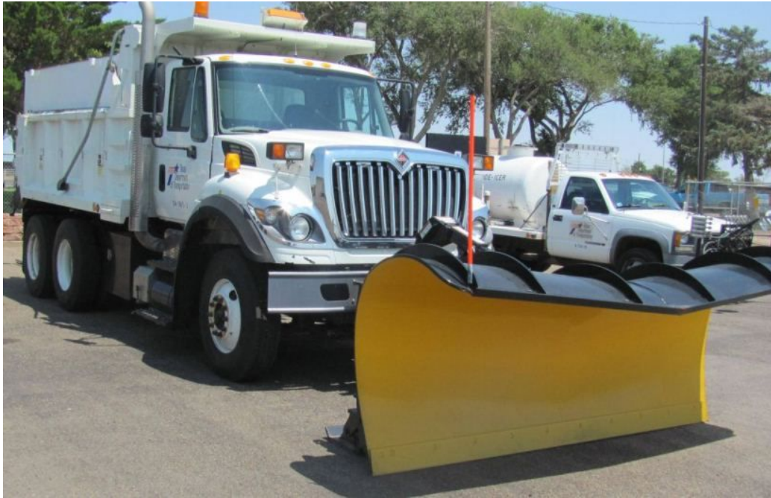
Figure 3-4. The Snow Plow is an attachment for a six- and 10-cubic yard truck. It is used to remove snow from the pavement.