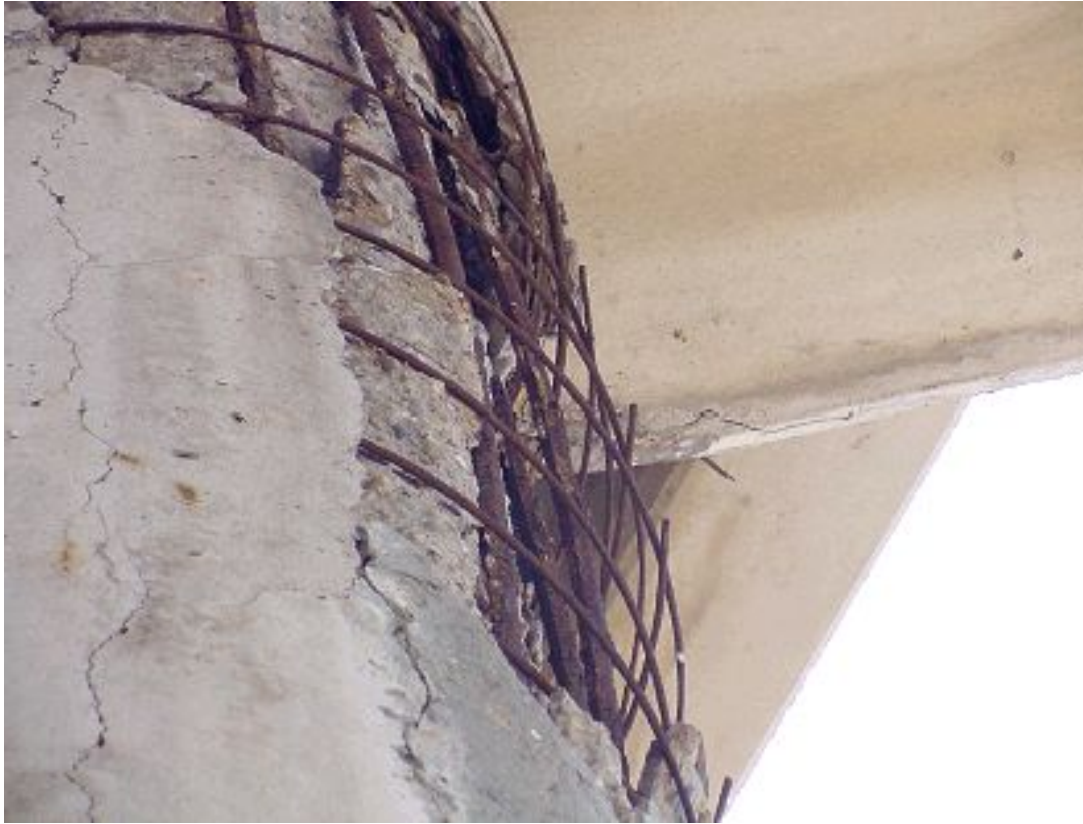
Figure 5-10. Close up of the damage. Notice the #9 bars are starting to buckle. Two reasons this could be happening: 1. Rust could be pushing on concrete causing the buckling. 2. The column could be shortening. This bridge was replaced after 20 years of service.