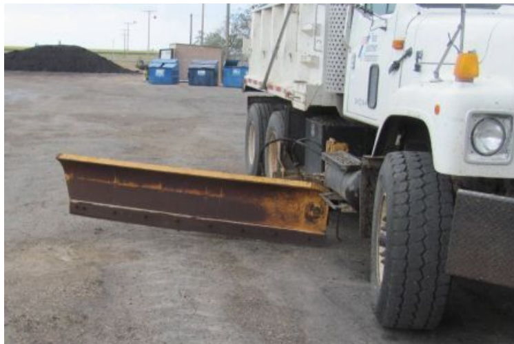
Figure 3-7. The snow wing attachment provides extra width on a motor grader or truck for plowing two lanes at a time or picking up a lane and a shoulder at the same time.