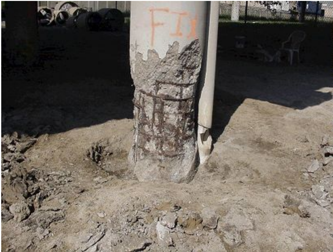
Figure 5-12. Damage created due to the salt storage.