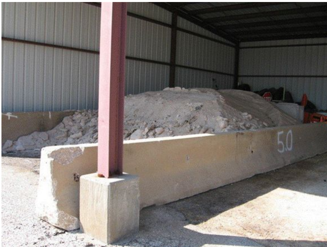
Figure 2-4. Salt Storage at TxDOT Maintenance Section Warehouse