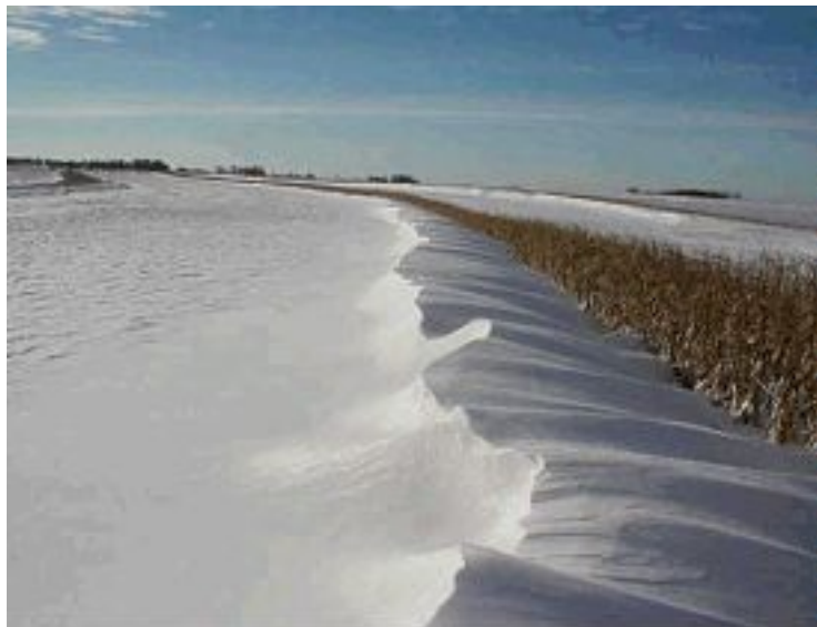
Figure 9-1. Living Snow Fence, courtesy University of Minnesota and Minnesota DOT.

Snow fences come in many different varieties and forms. There are the traditional wood fences, high-density polypropylene fabric, extruded polyethylene and even living snow fences. Living snow fences are designed plantings of trees and/or shrubs and native grasses located along roads or around communities and farmsteads. Properly designed and placed, these living barriers trap snow as it blows across fields, piling it up before it reaches a road, waterway, farmstead or community.