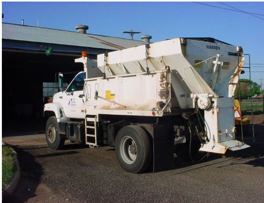
Figure 3-5. The V-Box Spreader is an attachment for a dump bed truck. It is used to accurately put out applications of de-icing materials on bridges and icy spots. These spreaders can either be hydraulic or gasoline operated.