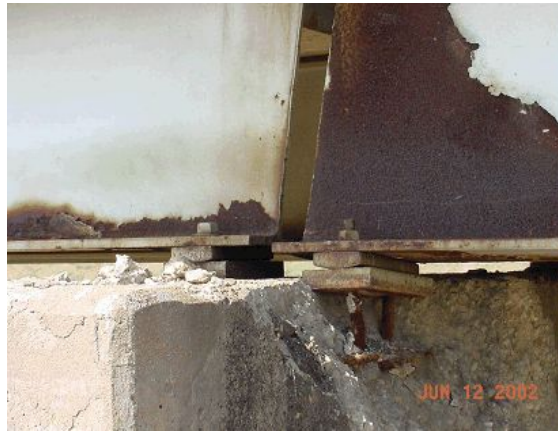
Figure 5-8. Failure on cap due to corrosion damage. Bridge was closed until repair could be performed.