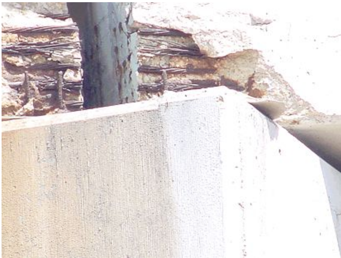
Figure 5-6. Close up of Figure 5-5.