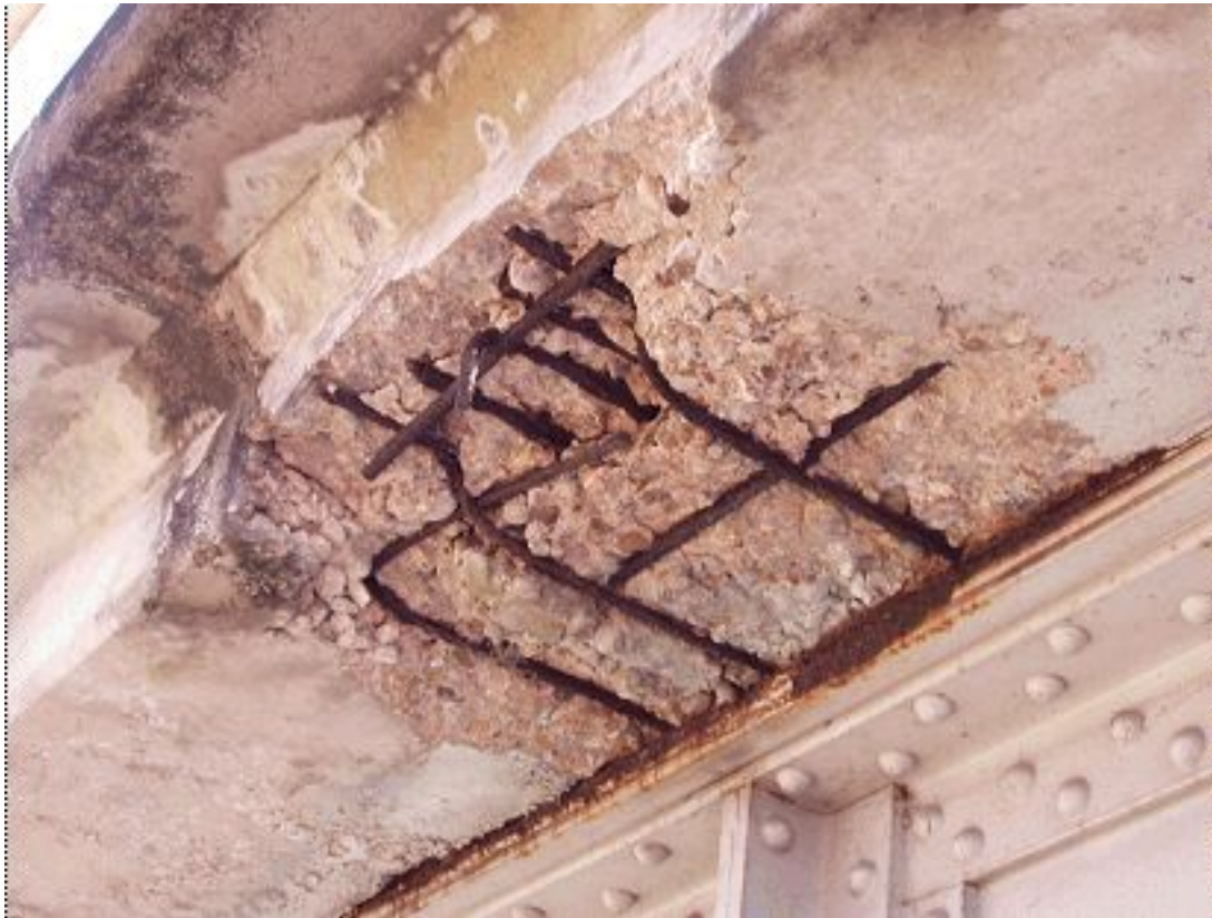
Figure 5-4. Poorly maintained joint allowed de-icer solution to damage overhang to second mat of steel and top plate steel on beam.