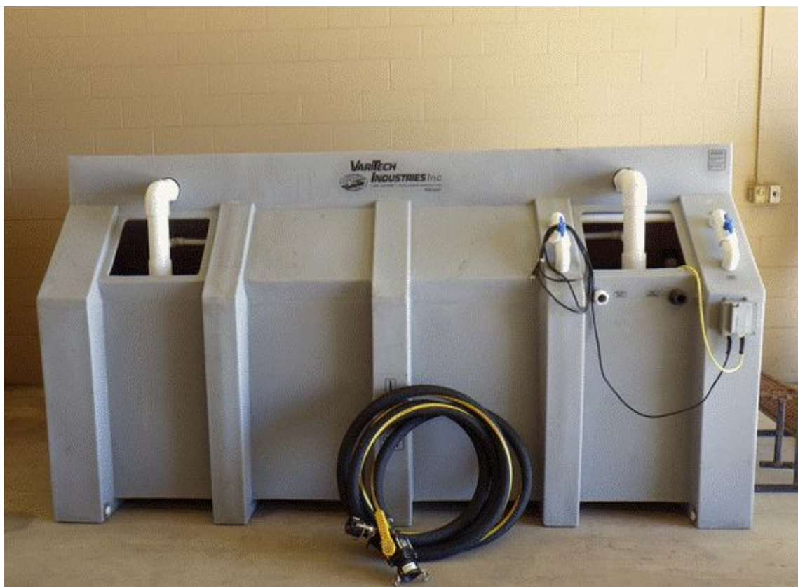
Figure 2-3. VariTech Industries Brine Maker