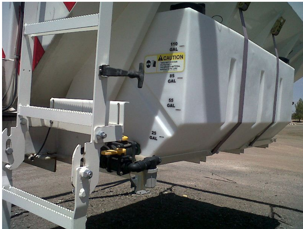
Figure 2-2. A saddle tank is a useful means of pre-wetting solid chemicals.

The practical result is a reduction in the resources necessary for maintaining the highway since a lower application rate translates into a spreader load covering more area, often requiring less deadheading (returning to the barn empty) to obtain material.