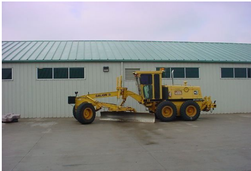
Figure 3-2. Motor-grader (maintainer) - This may be the best piece of equipment we have for snow removal. It does not require any other attachments to do the job. This piece of equipment is self-contained and ready to go.