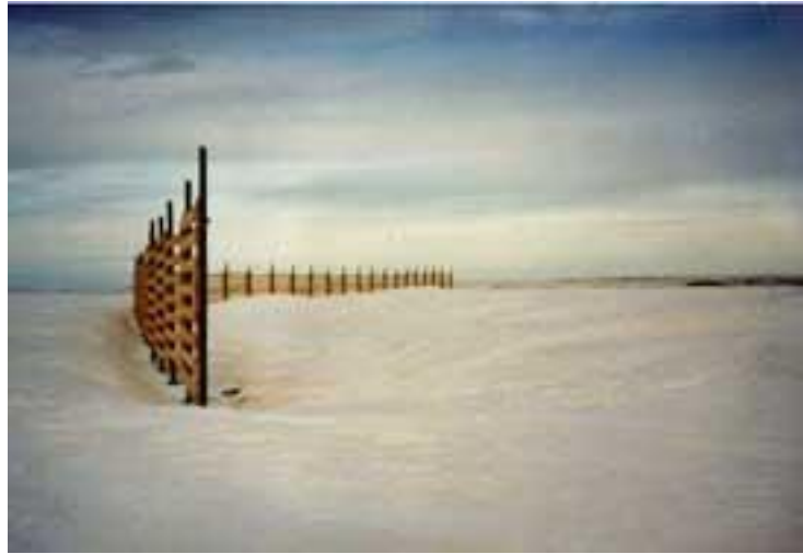
Figure 9-2. Wood Fence, courtesy University of Minnesota and Minnesota DOT.