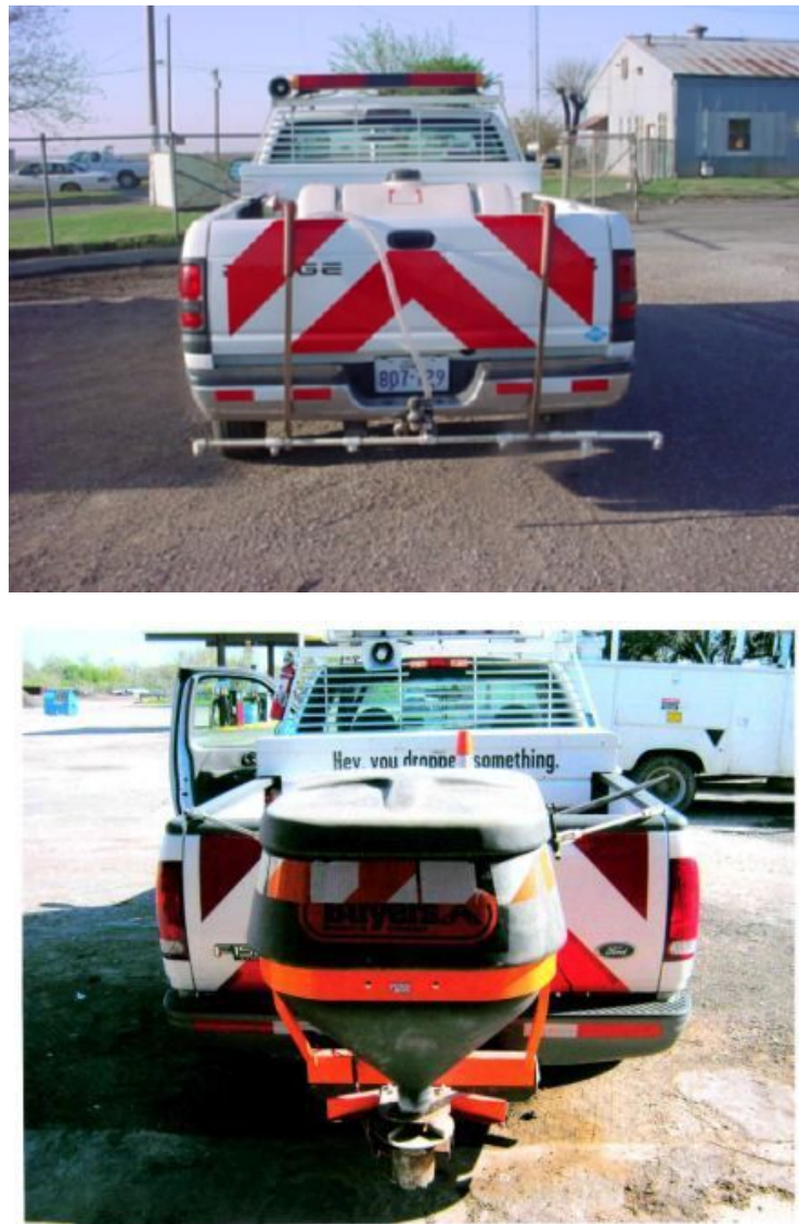
Figure 3-10. Pickup applicators are used to apply anti-icing liquids (top) and granular (bottom) materials prior to an approaching storm to small areas such as bridge decks, on and off ramps. They are also used for de-icing applications during the storm.