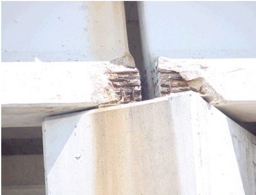
Figure 5-5. Chemical solution corrosion induced beam damage created by failed joint and poor concrete cover over beam ends.

Maintenance personnel should repair and maintain joint systems ensuring the protection created by the sealed joint systems.