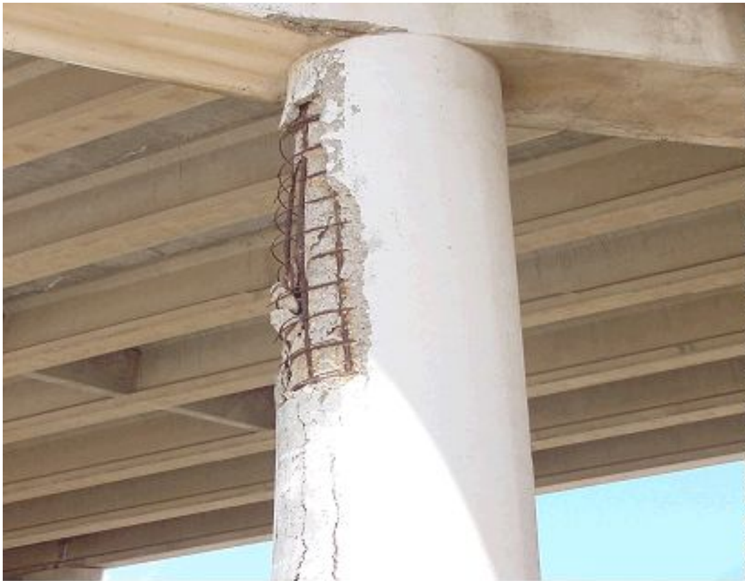
Figure 5-9. Column deterioration from chemical solution contamination.

To eliminate chemical damage to columns, do not store chemical materials next to columns and maintain and repair bridge joints.