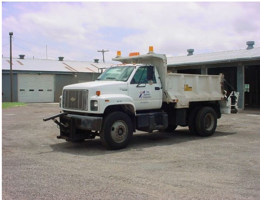
Figure 3-1. Dump trucks are the workhorses of TxDOT snow removal. Snow plows are mounted to dump trucks and are used to push the accumulated snow off the roadway. Spreaders are also mounted on dump trucks to facilitate the spreading of materials for snow and ice control.