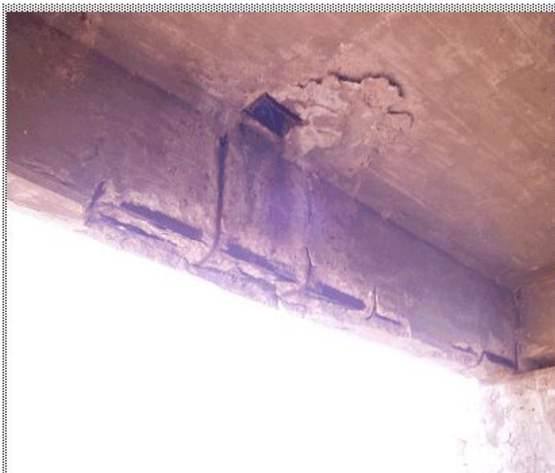
Figure 5-1. Corrosion damage due to concentrated de-icing solution at drain site.