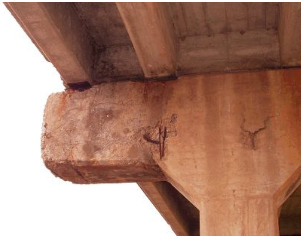
Figure 5-7. Corrosion induced damage in high stress cantilever design.

Maintenance personnel should maintain joint systems, eliminating the possibility of chemical solution saturating this structural element. If joint systems have failed, or are designed as an open system, caps should be washed at the end of snow season.