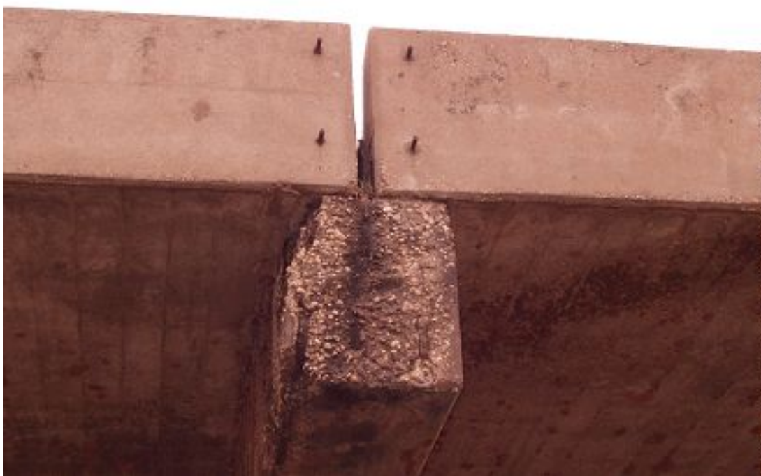
Figure 5-3. Poorly maintained joint allowed concentrated de-icer solution to damage cap.

TxDOT prefers bridge joint inspection and cleaning to be performed in the spring and re-inspection to occur prior to the beginning of snow season. This fulfills the annual bridge inspection criteria in accordance with the Maintenance Operations Manual