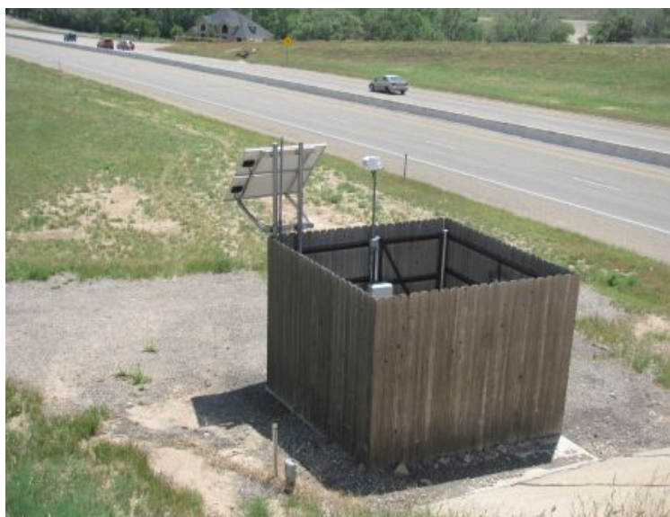
Figure 9-4. One means of achieving anti-icing is this automatic injection system in use in the Amarillo District. Photo shows chemical tank and controls, while the plumbing that gets the liquid to the road is underground.

There are two distinct snow and ice control strategies that have been gaining popularity and show promise in making use of chemical freezing-point depressants: de-icing and anti-icing. Anti-icing operations are conducted to prevent the formation or development of bonded snow and ice for easy removal, while de-icing operations are performed to break the bond of snow and ice and eliminate the buildup on the roads. See Chapter 2 , “Materials,” for information on the various chemicals available to use in these operations.