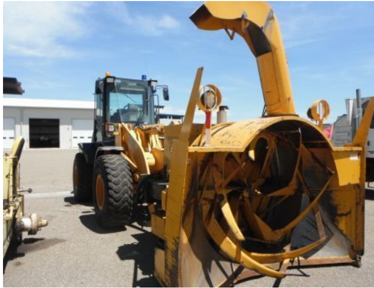
Figure 3-8. Snow blower is an attachment that is used to remove large quantities of snow.