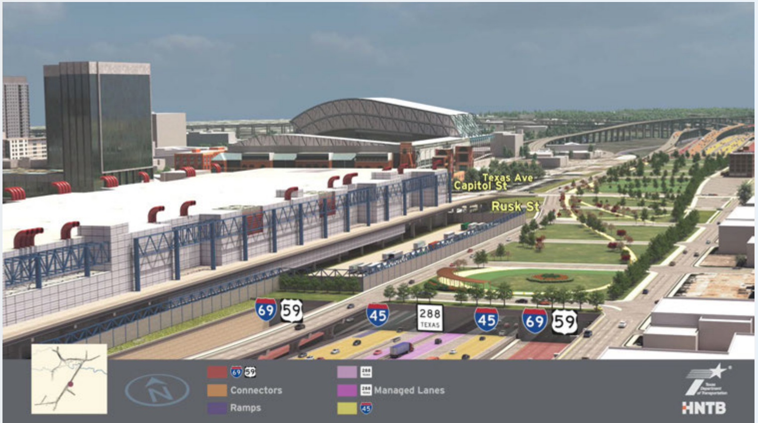
Segment 3 Visualization of Proposed Improvements near George R. Brown Convention Center.

impact analysis and identifying mitigation for adverse impacts that cannot be avoided per the current level design. Obtaining environmental clearance is a prerequisite of taking a project into detailed design where additional refinements and design improvements can be made. Accordingly, any changes in the design after environmental approval will be thoroughly evaluated and additional design development will be conducted and vetted with the public. TxDOT will keep the public engaged throughout the design and construction phases through a comprehensive outreach program.