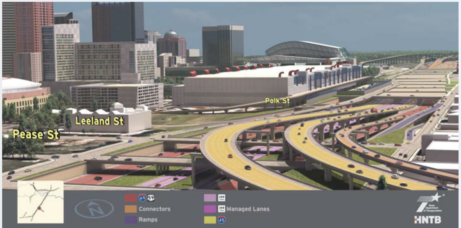
Segment 3 Visualization of Proposed Improvements near Polk Street.

TxDOT understands the importance of the North Street bridge to the local communities for access to Travis Elementary and for access to the White Oak Music Hall. To enhance circulation between the east and west side of I-45 without the North Street Bridge, a new northbound frontage road has been added between Quitman and North Main Streets. This will allow neighborhoods on the east side to access points of interest on the west side using North Main Street to Houston Avenue and return by using Quitman Street and the new northbound frontage road without having to enter I-45 at Quitman Street and exit soon after at North Main Street as one does today. North Main and Quitman Streets will have improved pedestrian and bicycle accommodations that separate these movements from vehicular traffic. In addition, raising I-45 above the floodplain creates the opportunity to make a first ever connection between Woodland Park and Moody Park.