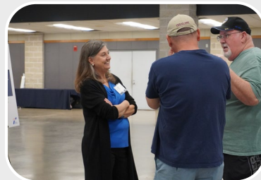
Developing Systems or Structures that Improve Grant Compliance