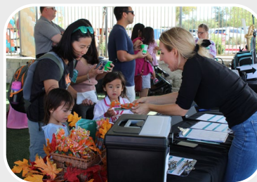
Community Capacity Building