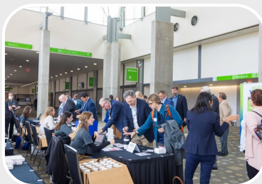
Supplementing Training, and Workforce Development Capacity