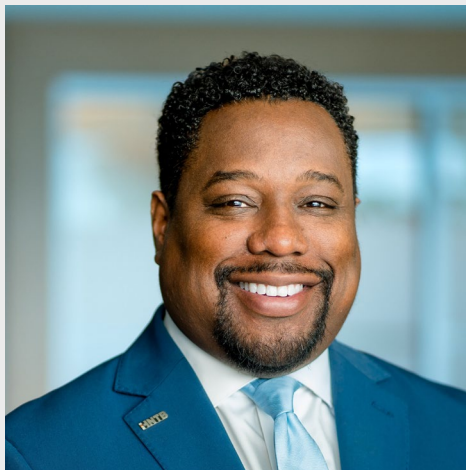
Charles Small Grant Support Program - Federal Technical Expert