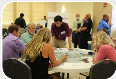
Support Grant Writing