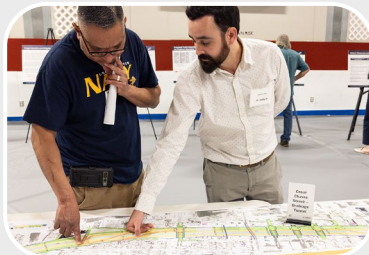
Identifying Funding Sources and Grants