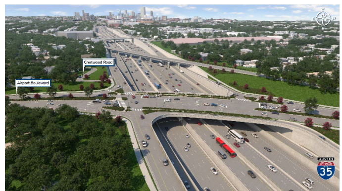
Figure 2- Future Airport Boulevard intersection