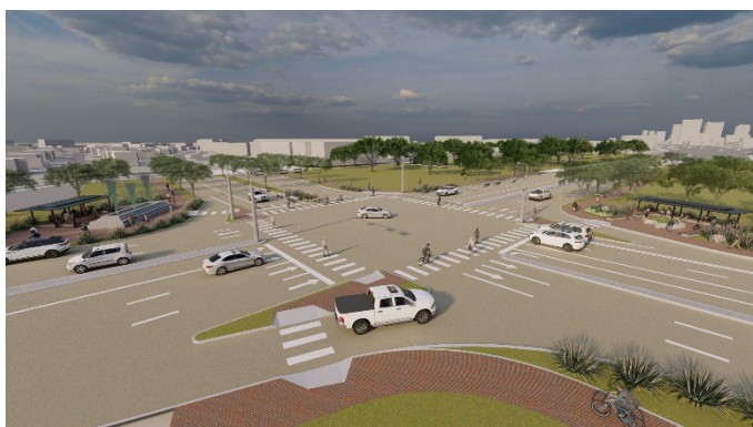
Figure 1- Future Dean Keeton Street intersection