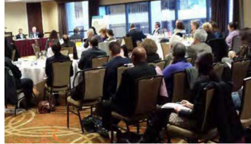
Downtown Stakeholder Working Group, 2013

TxDOT hosts the I-35 Capital Express Central Design Charrette to solicit input from stakeholders regarding previously developed concepts, including a plan to construct another upper deck on top of existing upper decks. More than 30 concepts were proposed over the course of the charrette.