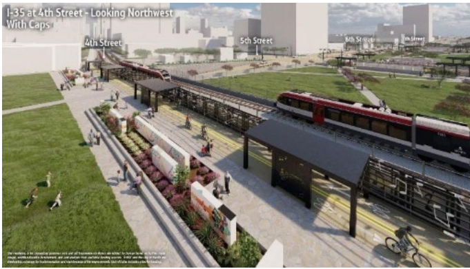
Figure 1- Future 4th Street crossing with CapMetro accommodations