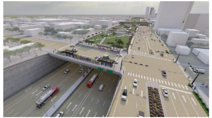
Figure 2- Future boulevard-style frontage road at 8th Street