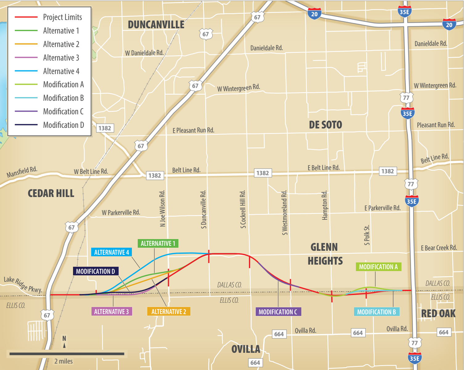
NOTE: Highlighted areas are not drawn to exact scale.