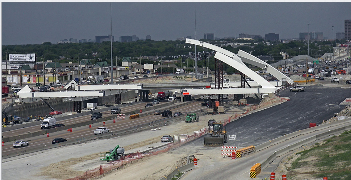
Here's a view of the new Skillman Street bridge steel structures moving into place over I-635.

Commission has designated the 635 East Project as part of the statewide Texas Clear Lanes initiative, organized to address the most congested roadways in the state's metropolitan areas. The project is designed to relieve congestion, provide local connectivity and improve safety.