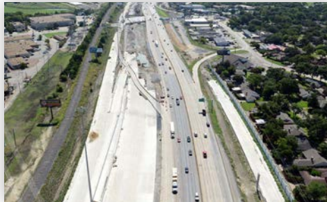
I-635 frontage roads at Royal Lane September 2022