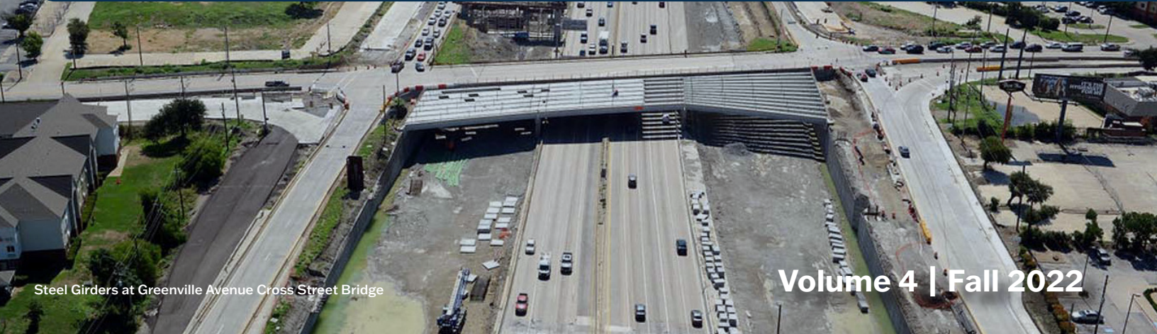
Steel Girders at Greenville Avenue Cross Street Bridge