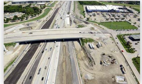
Galloway Avenue at I-30 September 2022