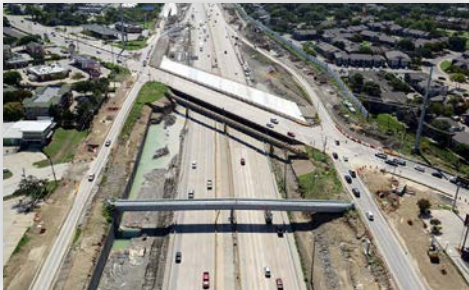
Skillman Street at I-635 September 2022

Progress photos are available on our website under the View Tab and updated monthly.