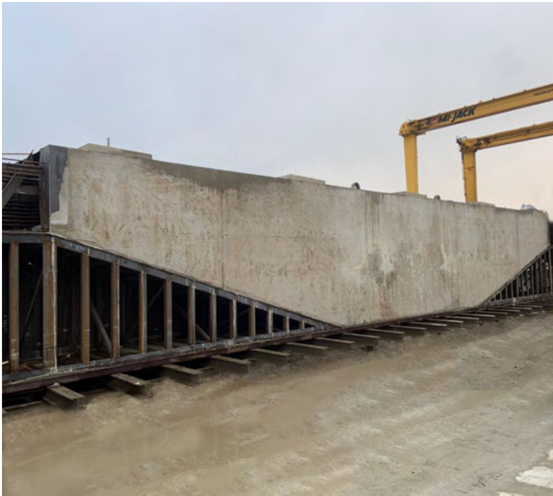
The first precast concrete column cap of the I-35 NEX Central project.

Did you know that Texas has over 55,000 bridges? As the owner of the nation's largest bridge inventory, the Texas Department of Transportation (TxDOT) is always looking for innovative ways to safely speed up bridge construction. One such solution is the use of precast concrete column caps on the I-35 NEX Central project.