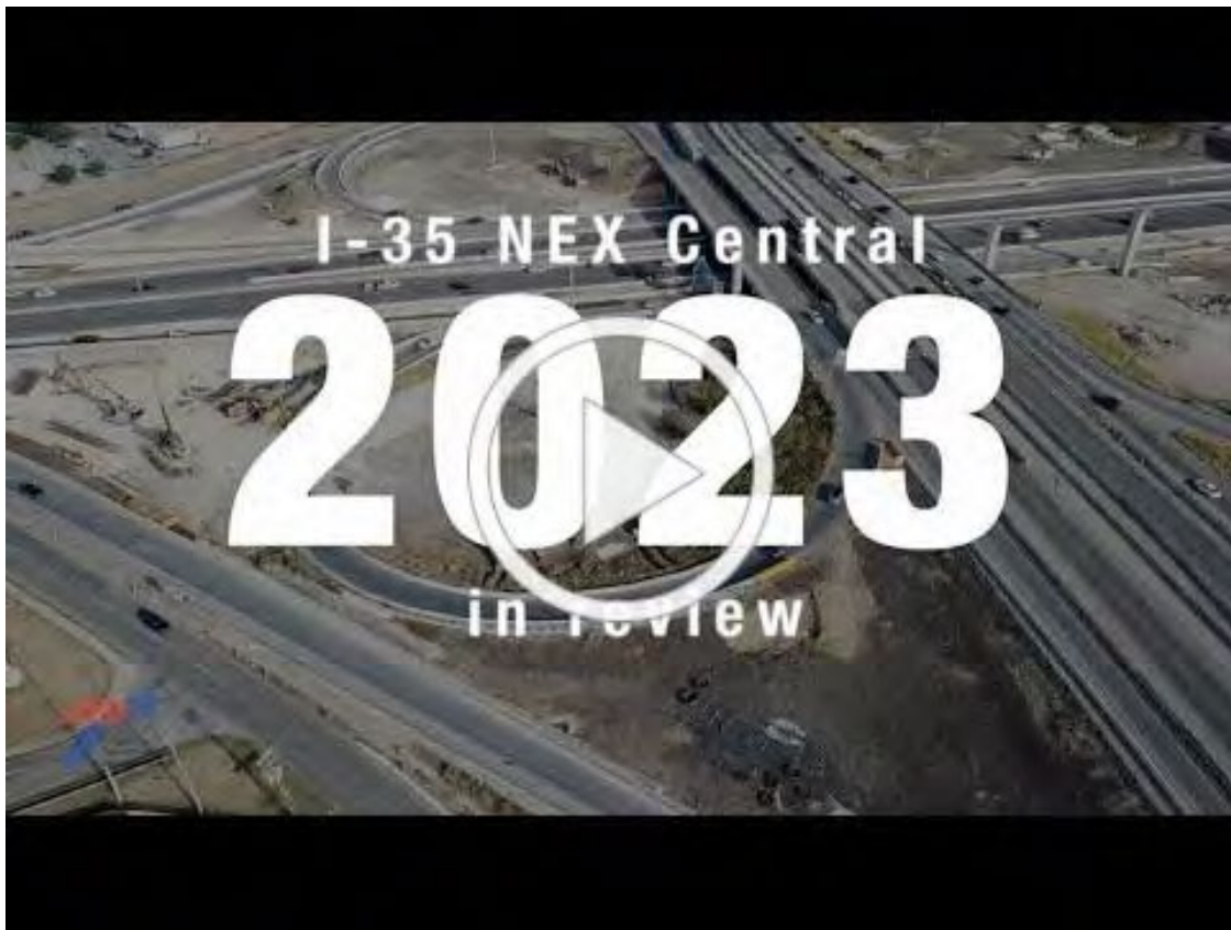
I-35 NEX Central project 2023 year-in-review video.

Look at how far we've come in 12 months! In January, we poured the first column of the I-35 NEX Central project on the southbound frontage road of I-35 near Farsight Drive. Since then, we have constructed over 220 columns. How many pounds of rebar have been used to make the bridge structures? How many drilled shafts have been excavated? Watch our 2023 year-in-review video to find out that information and more.