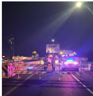
The photo above shows a nighttime lane closure

Due to the upcoming holidays, the I-35 NEX Central project team will publish lane closures for Dec. 25-Jan. 7 together on Dec. 22 in your weekly lane closure email. Additionally, please note there will be no construction starting at noon Dec. 23 through 10:00 p.m. Dec. 26, and from noon Dec. 31 through 10:00 p.m. Jan. 1.