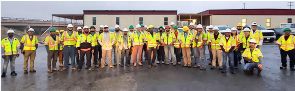
Pictured here are I-35 NEX Central construction team members at a regularly scheduled safety briefing.

Safety is a top priority on the I-35 NEX Central project. While there are inherent risks on a project of this magnitude, such as fall and struck-by hazards, the construction team implements countless safety measures to mitigate risks. The above photo was taken at a weekly safety meeting, where employees meet to discuss and learn more about critical safety topics and measures. Team safety huddles are also held daily to discuss key safety topics, while topic-specific safety trainings are held regularly to ensure employees have the proper training to keep them safe in their job duties.