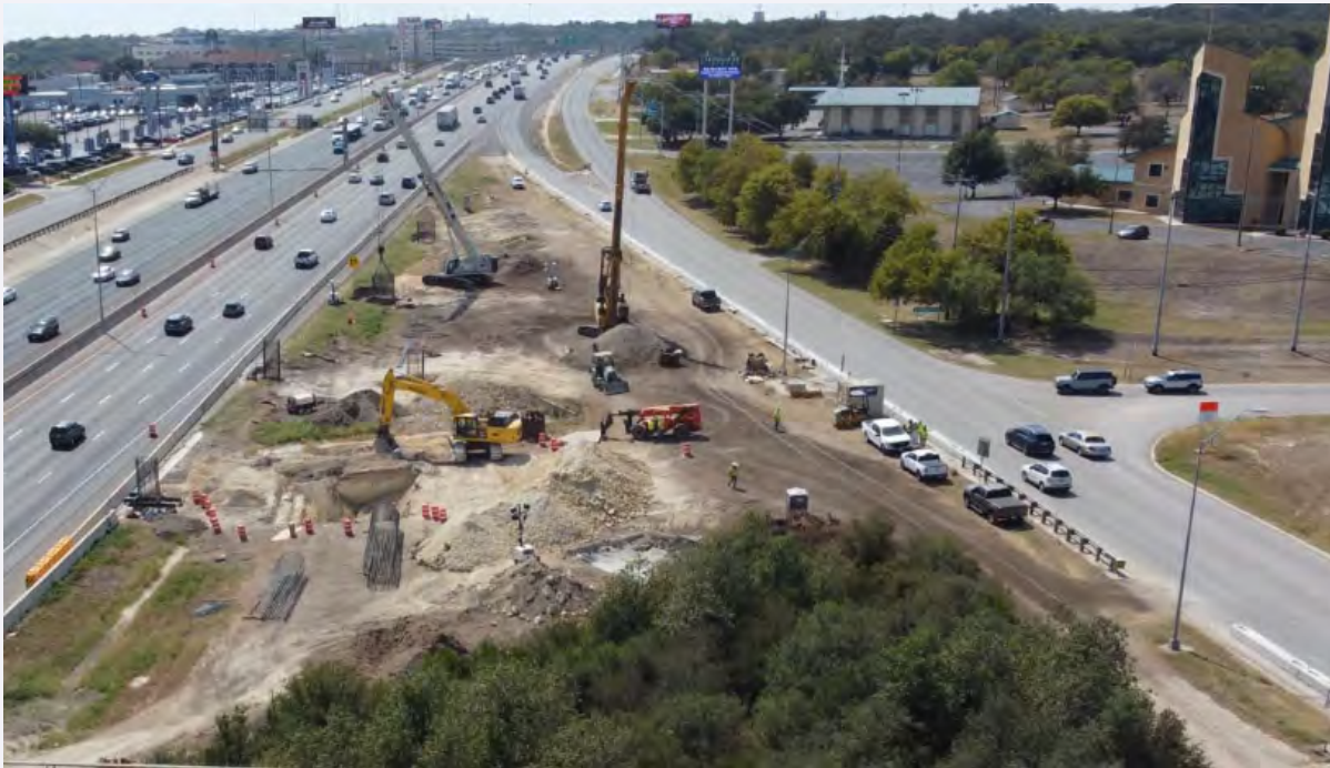
Pictured here is a southbound view of the drilled shafts operation on I-35 South and Pat Booker Road in the Live Oak area to prepare the foundations that will support the new elevated lanes.

At this time, the majority of construction is occurring overnight as the project team makes every effort to minimize traffic impacts. The drilled shafts operation is continuing at various locations within the project corridor. The project team expects drilled shafts to be a key focus of construction through the end of 2022. These drilled shafts will form the base of concrete columns to support the elevated lanes. Additionally, topsoil is currently being stripped to prepare for work platforms. You may also notice overhead sign boards being removed to prepare for work zones. The above photo depicts drilled shafts in progress near southbound I-35 and Pat Booker Road.