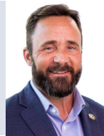
Mayor Cole Stanley City of Amarillo