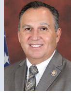
Mayor Alvaro "Al" Arreola City of Del Rio