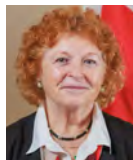
Hon. Susan Harper Consulate General of Canada in Dallas