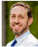
Hon. Andy Brown Travis County Judge