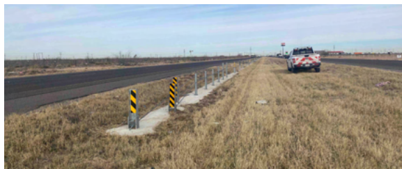
Figure 1. Installed median cable barrier.