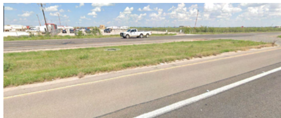
Figure 2. Roadway before installation of the cable barrier.