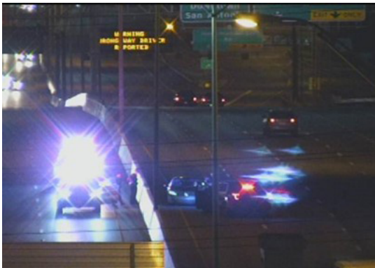
Figure 1. TransGuide WWD event and DMS alert.

Wrong-way driving (WWD) alerts in San Antonio currently consist of messages posted to dynamic message signs (DMS) located approximately every two miles along most freeways (Figure 1) in the district. The alerts are posted by TransGuide traffic management operators when either a San Antonio Police Department 911 WWD emergency tone is issued or when one of the ramp WWD detection systems senses a wrong-way vehicle, triggering an email alert which must then be processed by a TransGuide operator. There is a lag in both the time it takes operators to post WWD alerts on the DMS and the amount of WWD travel time before right-way drivers see the alert message.