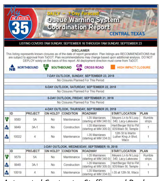
Automated Contractor Staffing and Deployment Report.