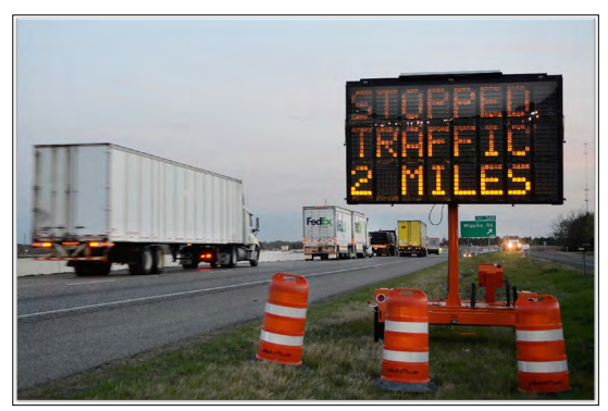
EOQ Warning System in operation on 1-35.