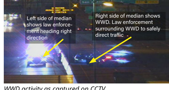
WWD activity as captured on CCTV.

The WWD countermeasures alert roadway users of potential hazards, thereby reducing the number of traffic crashes and other related incidents. Identification of high-risk locations for implementation of WWD countermeasures improves agency actions to speed response to WWD events.