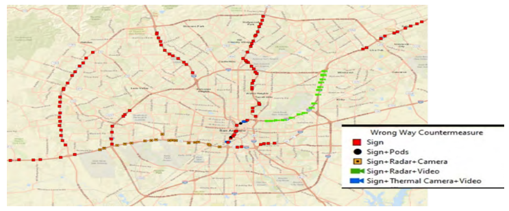
WWD countermeasures in San Antonio.