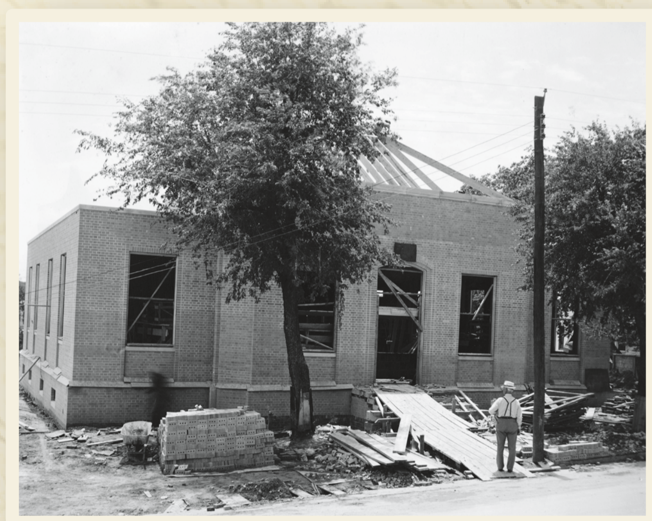
A laborer employed by the Federal Works Agency paused to admire his work. The FWA helped fund the building of public infrastructure, including the Hamilton Post Office.

Across America, unemployment was at an all-time high during the Great Depression. People needed money but many didn't want government handouts. In response, the government created work relief programs that allowed people to earn their wages while also benefiting their local communities. These work relief programs were accompanied by financial reforms and regulations to create the New Deal: a plan to relieve the effects of the Great Depression. The heavy use of acronyms to title these programs led to them being called "alphabet soup." In Hamilton County, these agencies included the National Youth Administration (NYA), the Civil Works Administrations (CWA), and the Works Progress Administration (WPA).