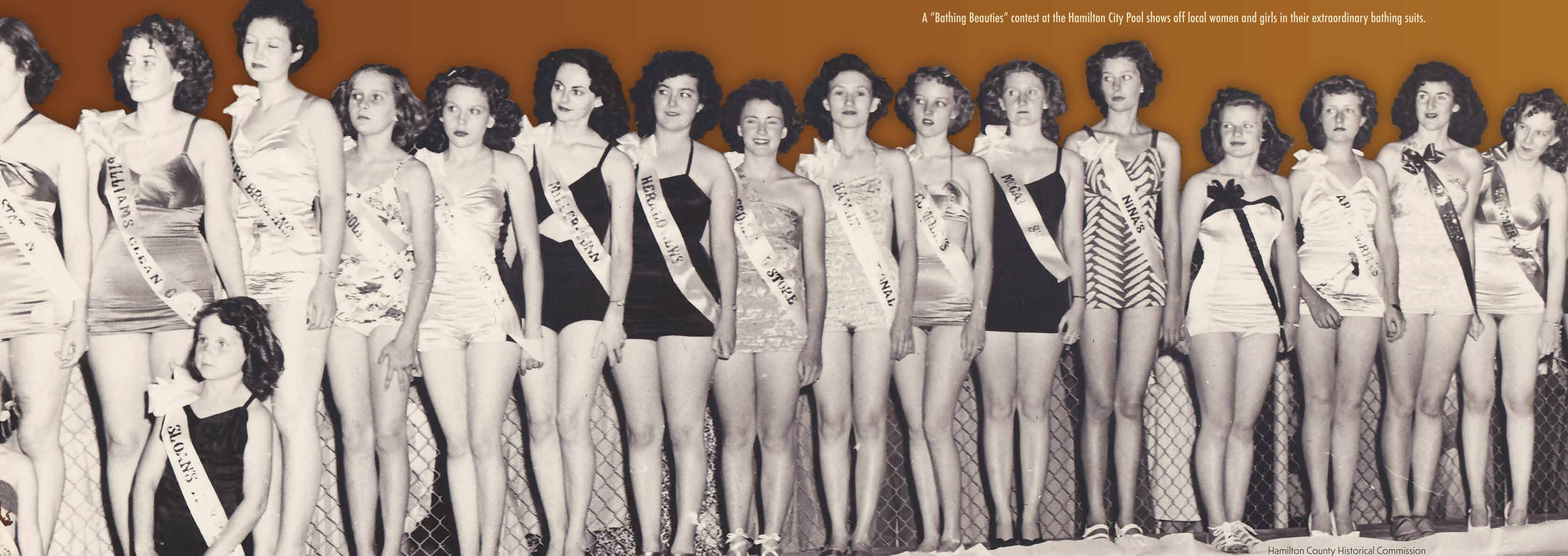
A "Bathing Beauties" contest at the Hamilton City Pool shows off local women and girls in their extraordinary bathing suits.

Roosevelt believed that getting Americans to exercise would help lift their spirits. As such, his New Deal programs valued creating spaces for recreation and physical activity. In Hamilton County, the Hamilton School District gymnasium and sporting courts were built with more than student athletes in mind. They allowed local residents to exercise where there wasn't space to do so previously. The Hamilton City Pool also helped people to remain active - and cool - despite the blazing Texas sun. The Hamilton City Pool provided the community with a source of entertainment, too, hosting family "bathing beauty" contests.