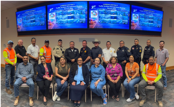
Figure 5: Laredo TIM Team meeting, March 6, 2026

The TxDOT Laredo Traffic Management Center (TMC) operates five days a week, from 8:00 a.m. to 5:00 p.m., serving the Laredo area with a network of 110 cameras and 36 Dynamic Message Signs. Notably, Laredo is one of the busiest international trade ports in the United States, featuring three international bridge crossings. A unique aspect of Laredo is its population dynamics; during the day, the population doubles as individuals cross from-Mexico to work and shop, returning to normal levels at night.