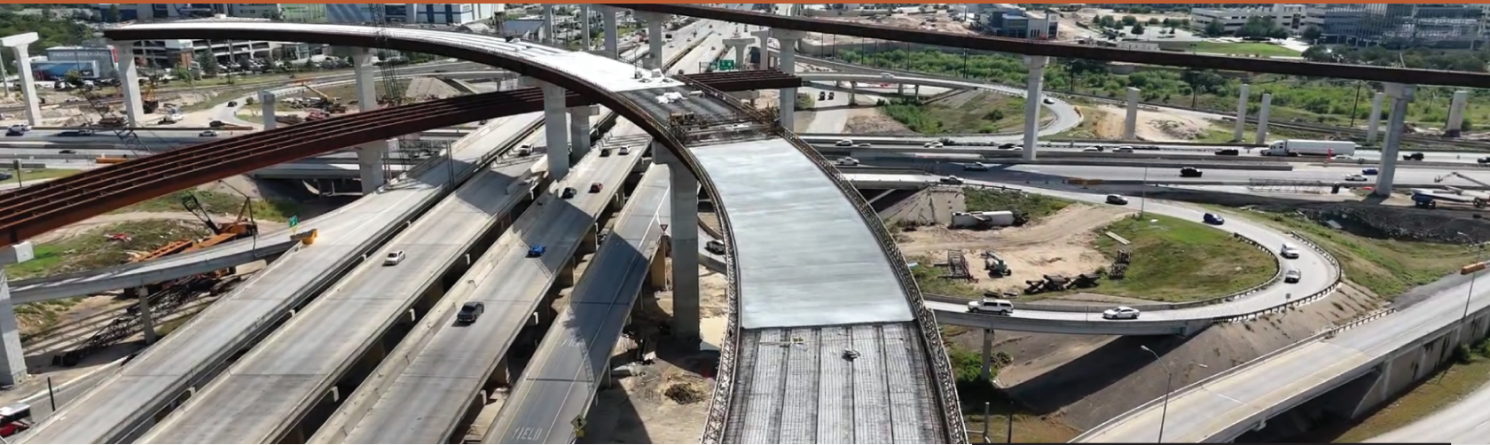
Photo above: Loop 1604 eastbound to I-10 westbound direct connector cap placement