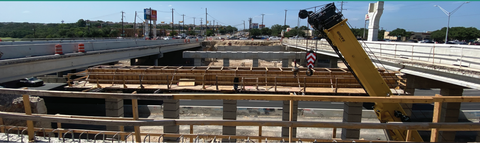
Photo above: Blanco Road northbound bridge substructure construction