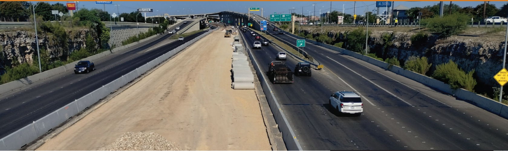
Photo above: Loop 1604 interior widening facing west at Gold Canyon