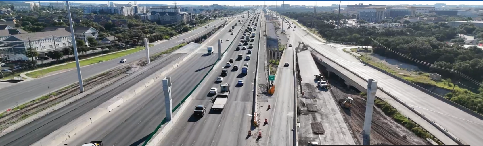
Photo above: Loop 1604 eastbound exit ramp/construction of new exit ramp to Chase Hill Boulevard