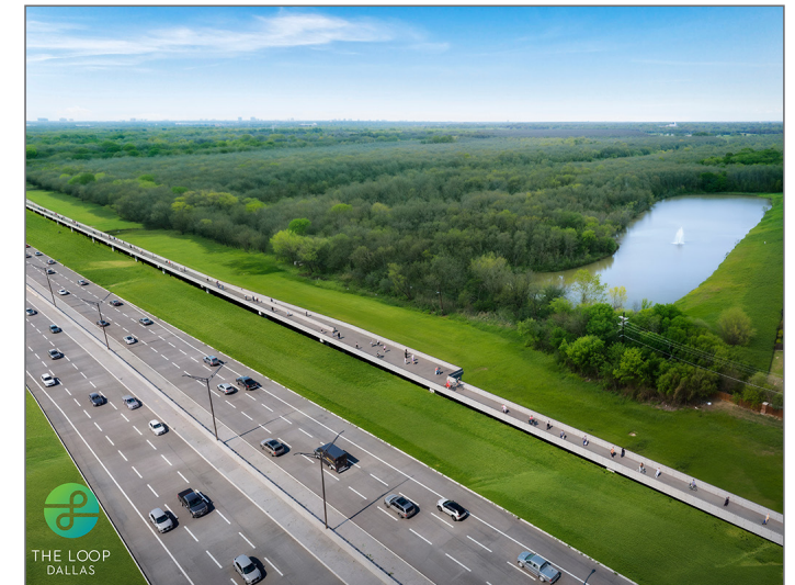
FIGURE 3: FUTURE PEDESTRIAN TRAIL

Future rendering view of US 175 at Lake June Bridge (also looking northwest from Lake June Bridge).