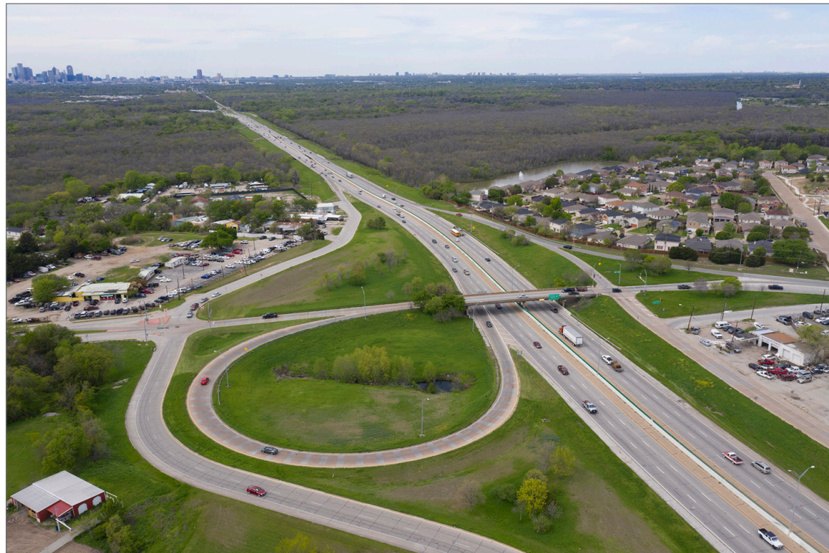
FIGURE 1: CURRENT CONFIGURATION

Dallas District Office 4777 E. Highway 80 Mesquite, TX 75150