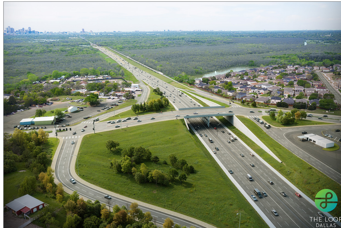
FIGURE 2: FUTURE CONFIGURATION

Current view of US 175 at Lake June Bridge (looking northwest from Lake June Bridge).