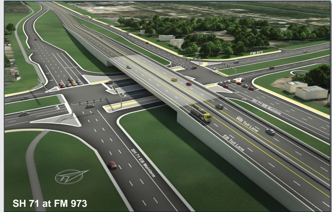
SH 71 at FM 973