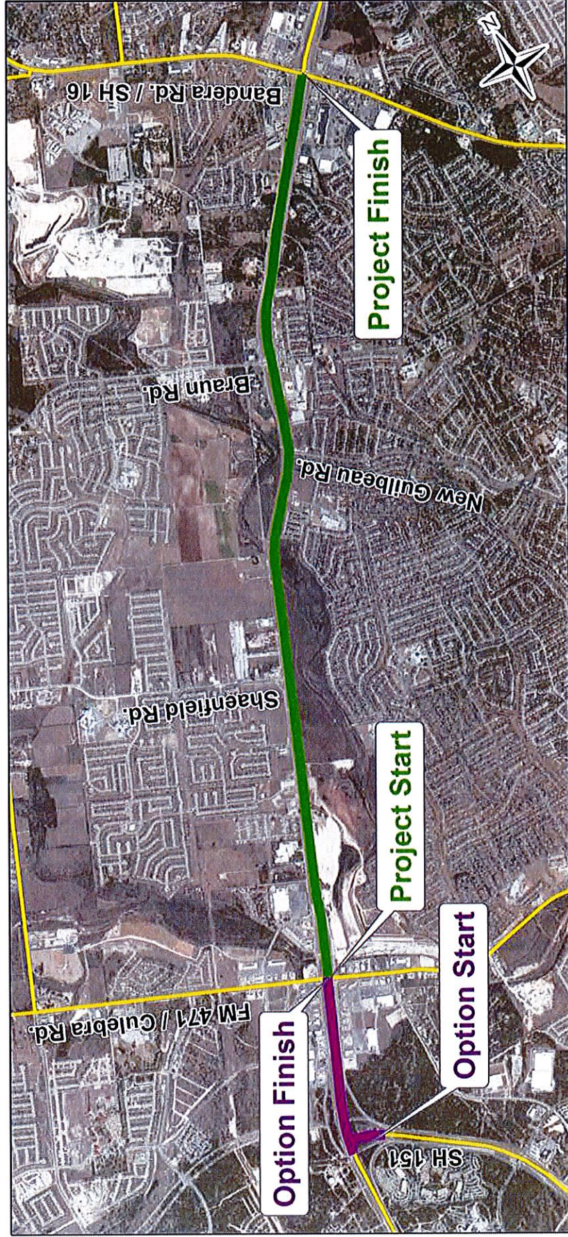
Exhibit B Loop 1604 Western Extension