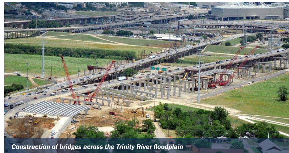
Construction of bridges across the Trinity River floodplain

The project included the addition of 7 lanes from 16 to 23 lanes in the original IH 30/IH 35E interchange, and the construction of more than 73 lane miles of new roadway, extension of the existing reversible high occupancy vehicle (HOV) lanes along IH 35E, 37 conventional bridges, and more than 60 retaining walls.