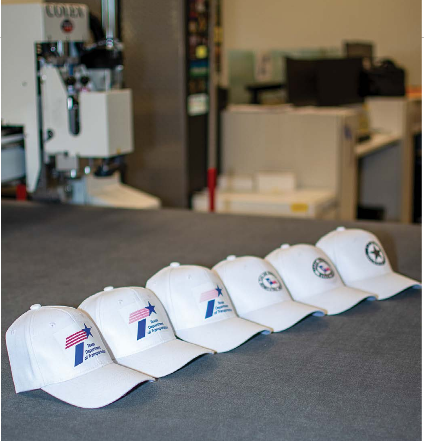
TxDOT's logo and brand continues to evolve.

forward. This is part of a larger vision to strengthen TxDOT's brand and feel on everything we publish – internally and externally. Kudos to Creative Services for their meticulousness.”