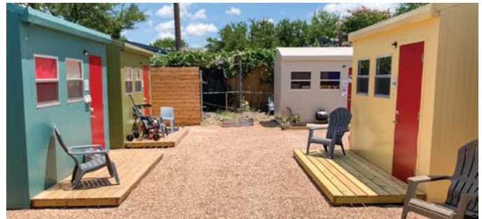
TxDOT recently acquired an additional seven acres adjacent to Esperanza Community, a non-congregate emergency shelter complex in the Austin District.

The foundation's mission is to transition Austin's homeless population into a productive community through shelter, opportunity and support. Programs