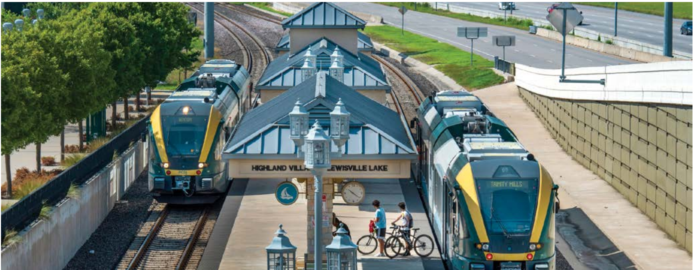
TxDOT is developing a Statewide Multimodal Transportation Plan to identify the needs for transit options like this commuter rail in Denton.

T xDOT is currently developing a Statewide Multimodal Transportation Plan to identify strategies for improved mobility and connectivity across Texas.