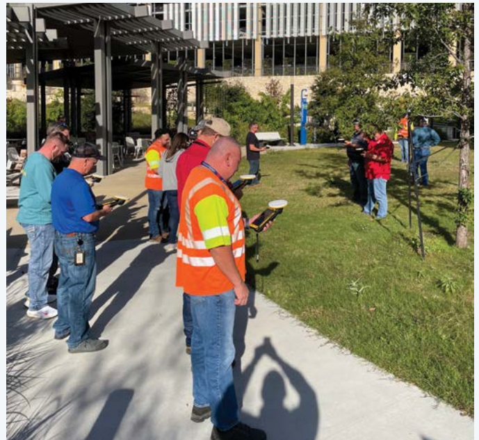
Employees test out their new surveying equipment at a training session in Austin.