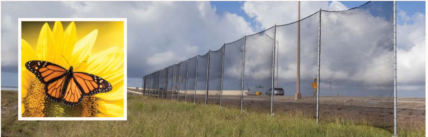
Monarch flight diverters are being tested in hopes the netting will force the butterflies to fly above the road and avoid traffic.

R esearchers in the San Angelo District are testing a new device to help more monarch butterflies survive their annual trek through Texas.