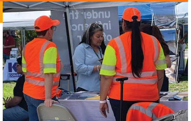
The Austin District recently hosted the "I Built This" Workforce Rangers Job Fair.

This is the second "I Built This" Workforce Rangers Job Fair hosted by the Austin District and its partners. ■