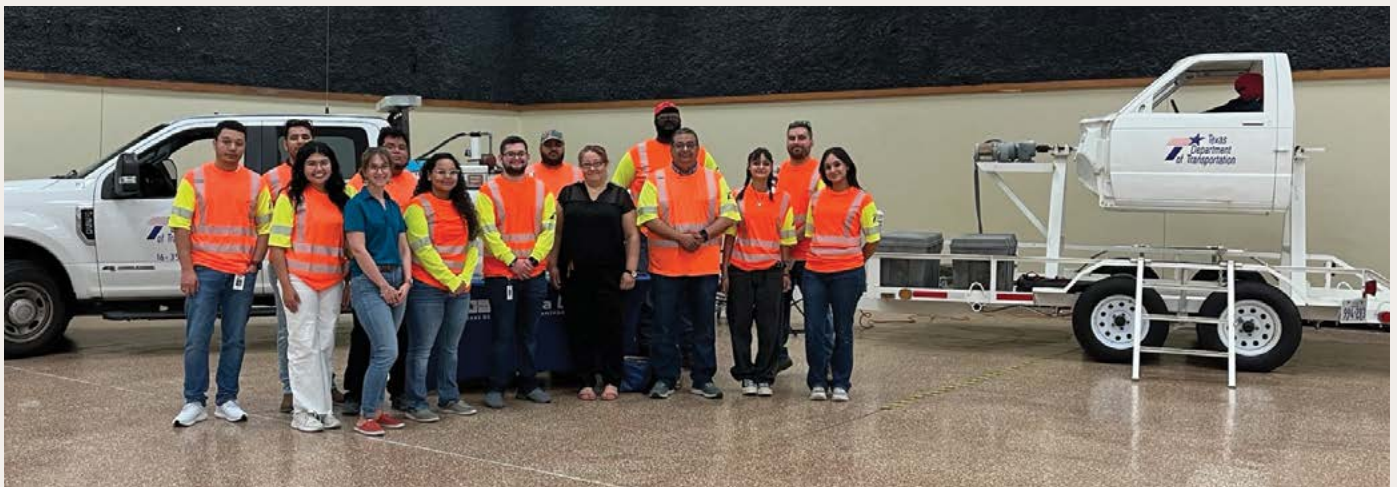
Corpus Christi District staff and volunteers at a safety event last year pose with the Rollover Convincer, a way to help kids, teens and parents understand the importance of using safety belts.

T he Corpus Christi District recently launched an initiative to bring TxDOT's strong safety culture to all aspects of life.