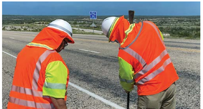
The 2024 Safe Days of Summer campaign runs May 1 to Aug. 29.

Safety tips will be distributed throughout the summer. While the summer months can be challenging for TxDOT employees, with excessive heat and increased road construction and maintenance operations, the Safe Days of Summer campaign reminds everyone to prioritize safety and look out for our co-workers.