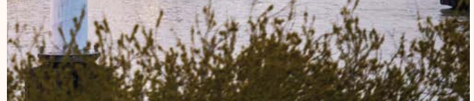
The new Galveston ferry can transport up to 70 passenger vehicles.

I n March, TxDOT proudly unveiled a state-of-the-art ferry vessel, Esperanza “Hope” Andrade, the first Galveston ferry to be named after a woman and the first to be named after a Latina. The celebration took place on International Women’s Day, adding an extra layer of significance to the occasion. This is the latest vessel added to the fleet of ferries running from Galveston Island to the Bolivar Peninsula.