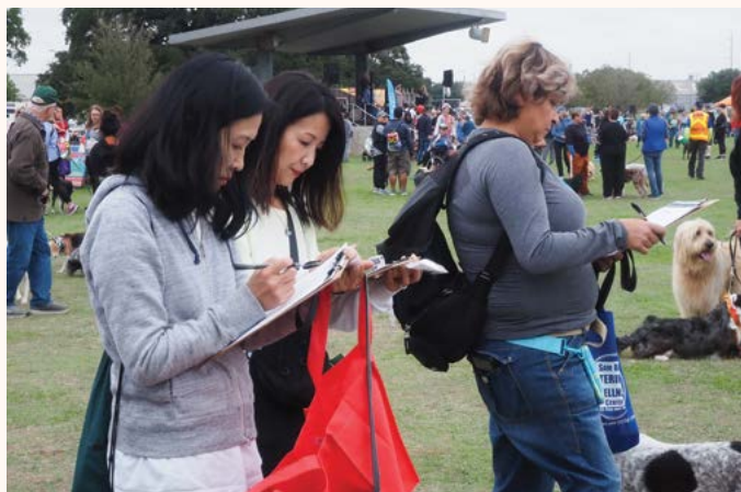
Last fall, the Statewide Active Transportation Plan team attended the Mighty Texas Dog Walk to get feedback from the public about their priorities.

Under the umbrella of its Statewide Active Transportation Plan, the division is expected to deliver a series of recommendations by year's end to ensure Texans and Texas can keep pace with the state's growth and keep people and business moving.