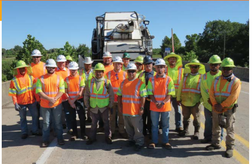
The Houston District won a 2023 Quality in Construction Award for the work of the Fort Bend/Waller Area Office design team and contractors Durwood Greene Construction Co. and American Materials Inc.

The project was designed by the Fort Bend/Waller Area Office design team. The project was also selected for the 2023 TxDOT/TXAPA Quality Asphalt Pavement Award in the Specialty Mixes Division Category. ■