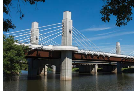
TxDOT was named Owner of the Year for its implementation of steel bridges like the Brazos River Bridge in Waco.