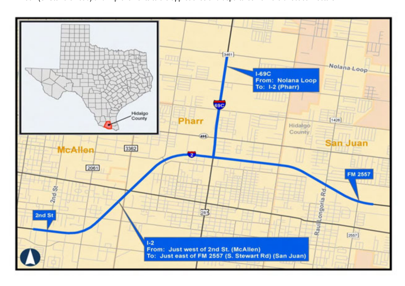
Figure 1-1: Project Map

The Project consists of the design and construction of 7.8 miles of improvements along I-2 from just west of 2nd Street to just east of FM 2557 (S. Stewart Road) and I-69C from Nolana Loop to I-2 in the cities of McAllen, Pharr and San Juan, in Hidalgo County, including (i) the full reconstruction of the I-2/I-69C interchange to include two-lane direct connectors in all four directions, (ii) the reconstruction and/or widening of the I-2 general purpose lanes from six to eight (four in each direction) from 2<sup>nd</sup> Street to the I-2/I69C interchange, and (iii) operational improvements including the reconfiguration of mainlane ramps on I-2 from 2<sup>nd</sup> Street to FM 2557 (S. Stewart Road) and improvements to the approaches and departures from the direct connectors.