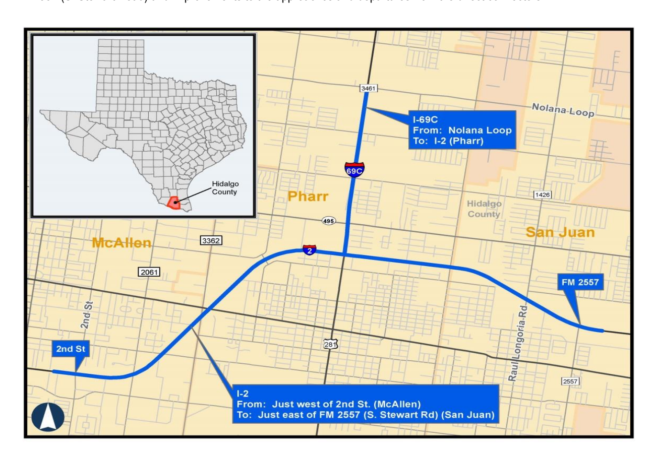
Figure 1-1: Project Map

The Project consists of the design and construction of 7.8 miles of improvements along I-2 from just west of 2nd Street to just east of FM 2557 (S. Stewart Road) and I-69C from Nolana Loop to I-2 in the cities of McAllen, Pharr and San Juan, in Hidalgo County, including (i) the full reconstruction of the I-2/I-69C interchange to include two-lane direct connectors in all four directions, (ii) the reconstruction and/or widening of the I-2 general purpose lanes from six to eight (four in each direction) from 2<sup>nd</sup> Street to the I-2/I69C interchange, and (iii) operational improvements including the reconfiguration of mainlane ramps on I-2 from 2<sup>nd</sup> Street to FM 2557 (S. Stewart Road) and improvements to the approaches and departures from the direct connectors.