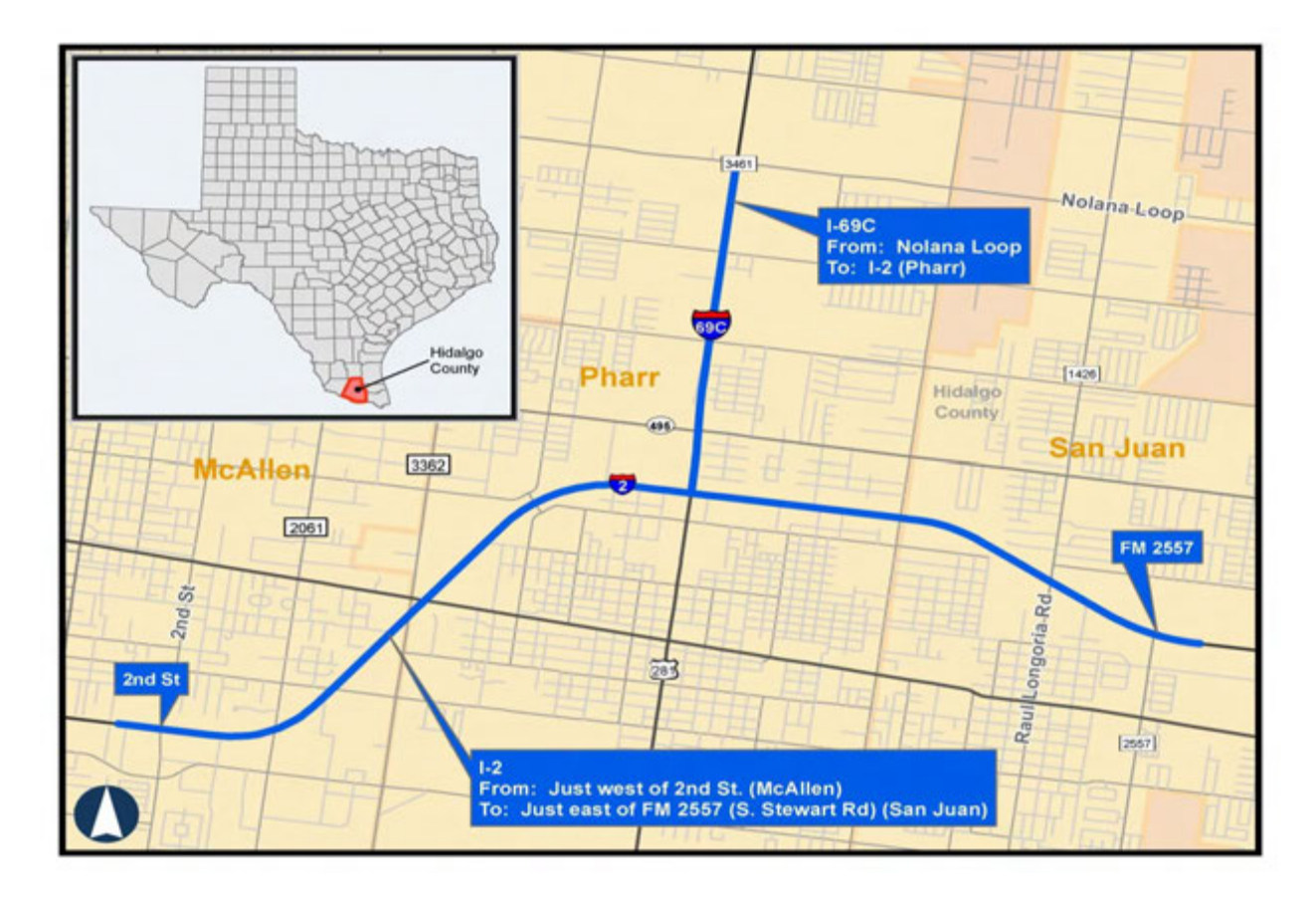
Figure 1-1: Project Map

The Project consists of the design and construction of 7.8 miles of improvements along I-2 from just west of 2nd Street to just east of FM 2557 (S. Stewart Road) and I-69C from Nolana Loop to I-2 in the cities of McAllen, Pharr and San Juan, in Hidalgo County, including (i) the full reconstruction of the I-2/I-69C interchange to include two-lane direct connectors in all four directions, (ii) the reconstruction and/or widening of the I-2 general purpose lanes from six to eight (four in each direction) from 2<sup>nd</sup> Street to the I-2/I69C interchange, and (iii) operational improvements including the reconfiguration of mainlane ramps on I-2 from 2<sup>nd</sup> Street to FM 2557 (S. Stewart Road) and improvements to the approaches and departures from the direct connectors.