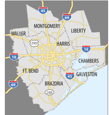
ConnectSmart 8-County Region

FUNDING: $18 million grant, funded 50/50 by the State and USDOT ATCMTD grant.