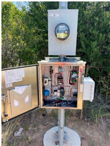
System adapted and installed on existing service. Services do not need upgrading to install.

This initially reactive response to illumination outages has become a proactive solution allowing for faster and safer response. The productivity of technicians and equipment is enhanced by reducing travel time, troubleshooting time, and repair time. Furthermore, the illumination system is now operating at an increased capacity, which is a proactive method of improving roadway safety, while decreasing cost to TxDOT and taxpayers.