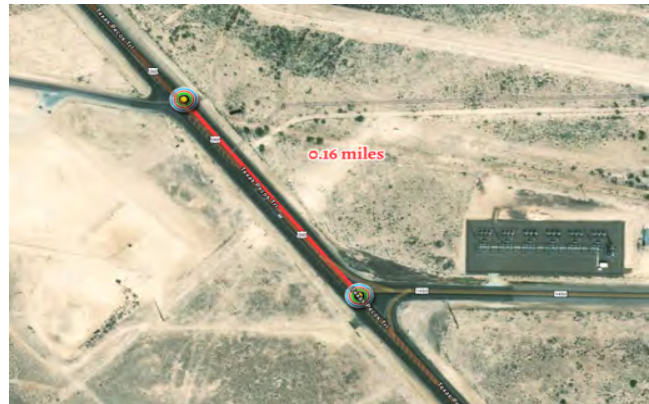
Example Segment Level Review.

It is important that a proactive approach be taken when addressing areas where driveways are being consolidated. Outreach to impacted property owners and business operators early in the process is critical to a successful project.